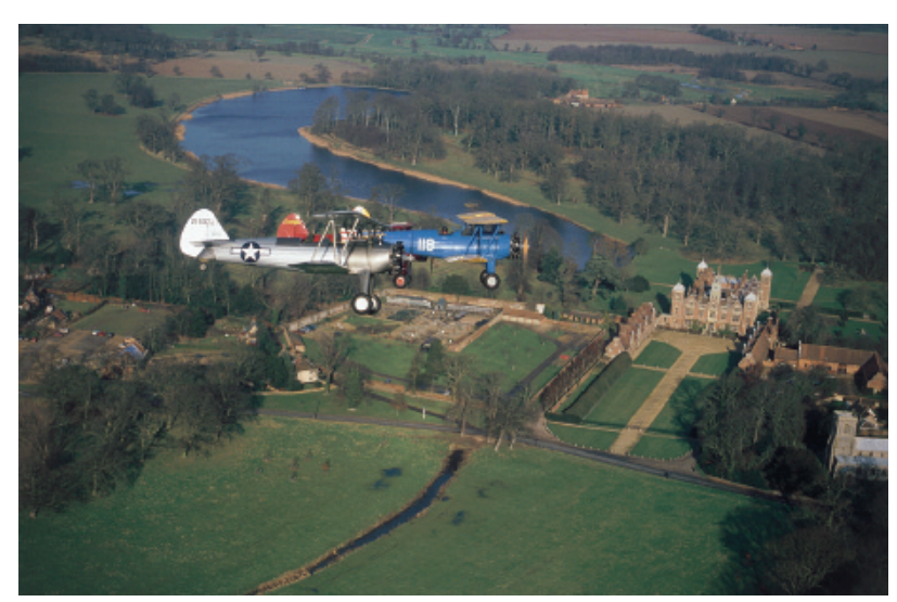
Three Stearman biplanes passing picturesque Blickling Hall where RAF personnel were fortunate to be billeted during operations from Oulton nearby. Evidence of the RAF occupation, which included access to the lake for swimming and dinghy drills, can still be found today.