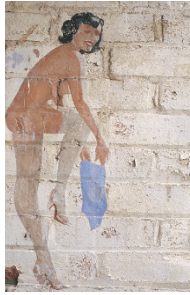
Pin-up at Shipdham inspired by a Gillette A. 'Gil' Elvgren model, many of which appeared in various painted poses on popular pin-up calendars.