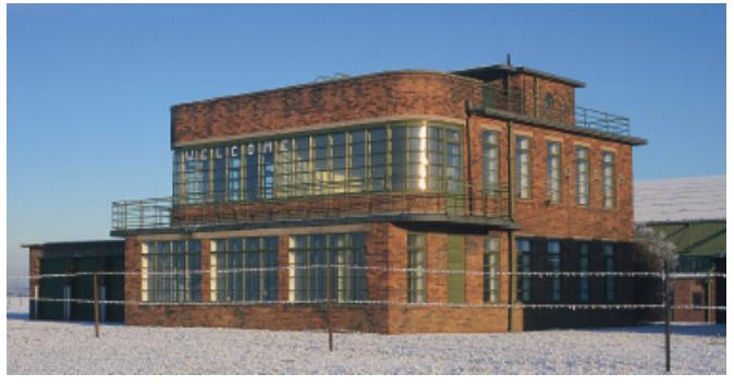
Villa-style watch tower at Swanton Morley airfield and now a Grade II listed building.