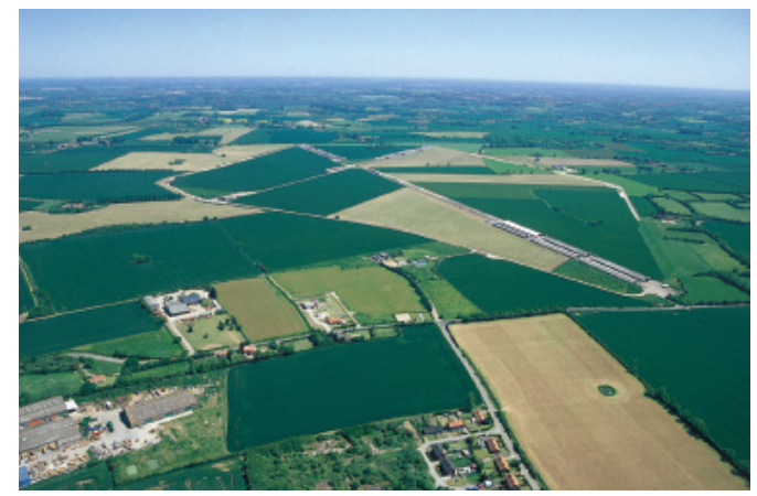
Originally, the airfield at Wendling in the parish of Beeston near East Dereham was intended for RAF bomber use but in 1943 it was turned over to the 8th Air Force. The airfield was sold in 1963-64 and became a Bernard Matthews turkey farm with long turkey sheds being constructed on the runways.